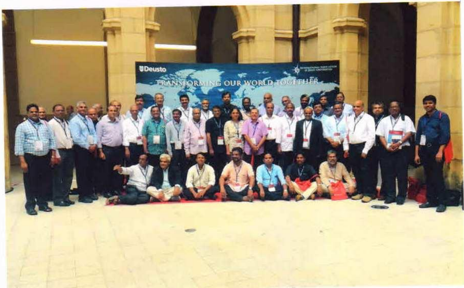
South Asian Assistancy (46 delegates)