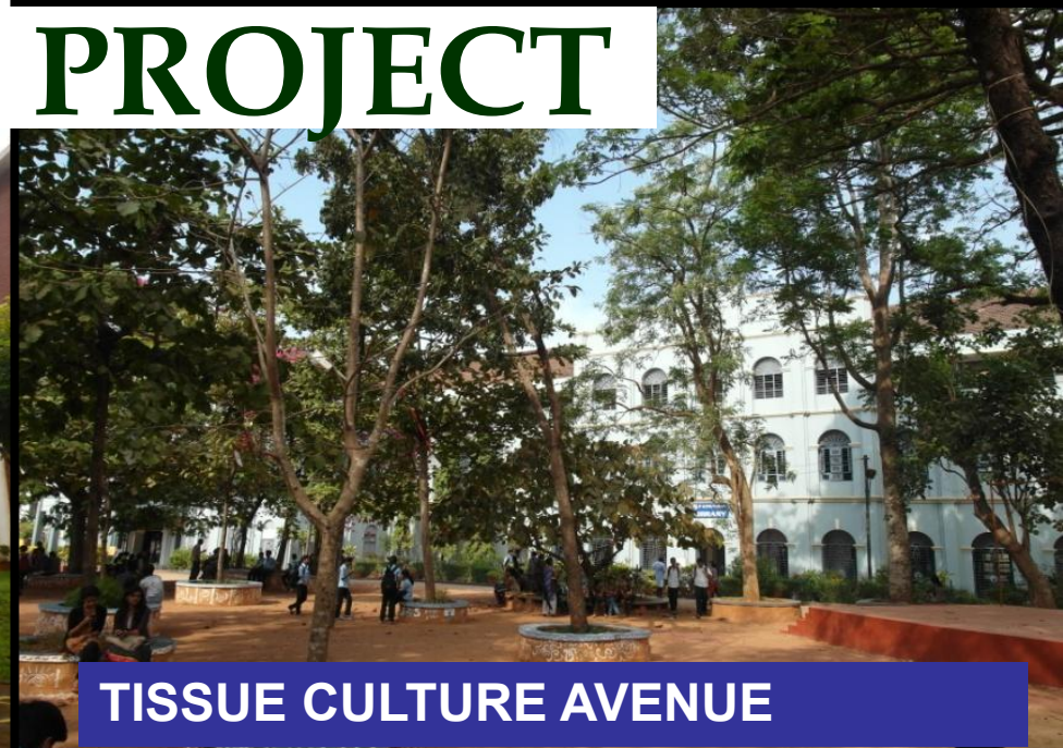
TISSUE CULTURE AVENUE