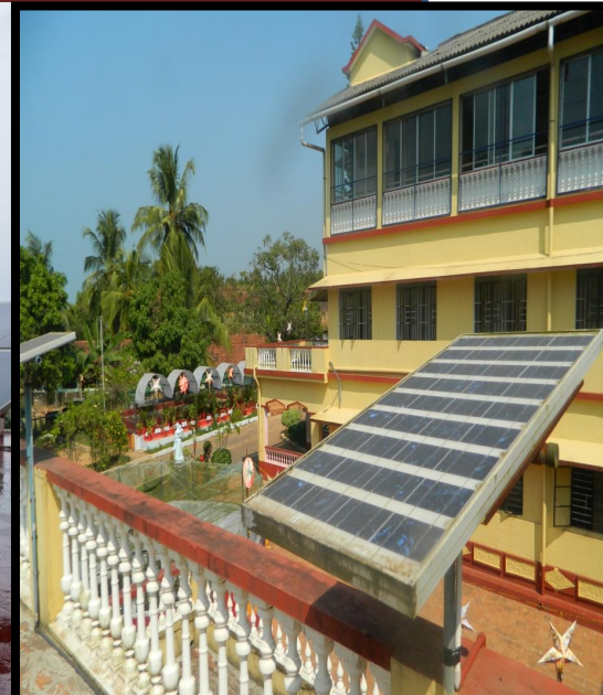
Use of renewable energy