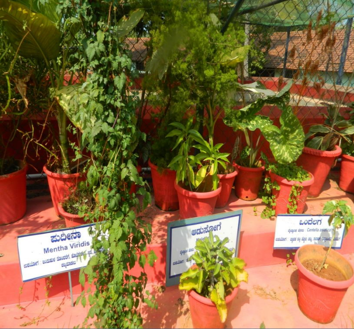
Green Mapping of the Campus